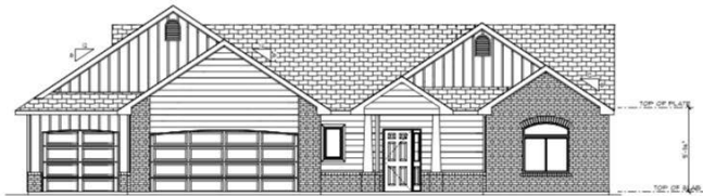
FRONT ELEVATION 1/4"=1'