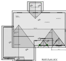
ROOF PLAN 1/8"=1'